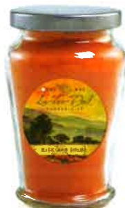
#04490 Classic jar (10oz) $10.00