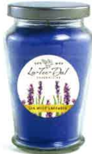
#04494 Classic jar (10oz) $10.00