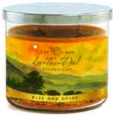
#06610 3-wick jar (14oz) $20.00