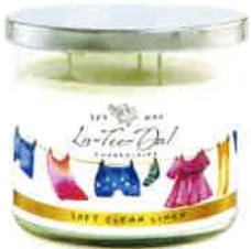
#06612 3-wick jar (14oz) $20.00