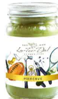
#06027 Mason jar (16oz) $15.00