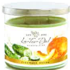
#06605 3-wick jar (14oz) $20.00