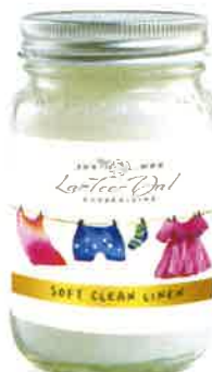
#06031 Mason jar (16oz) $15.00