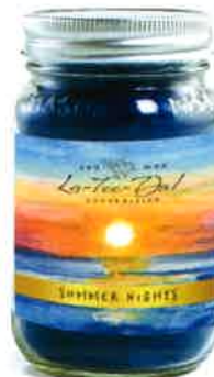
#06032 Mason jar (16oz) $15.00