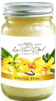
#06033 Mason jar (16oz) $15.00