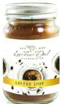
#06025 Mason jar (16oz) $15.00