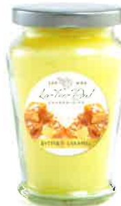
#04492 Classic jar (10oz) $10.00