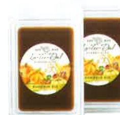
#02342 2 Pack Wax Melts (2.5oz) $10.00

A delicious and enticing blend of clove, cinnamon, and nutmeg wrapped in pumpkin and vanilla make this luscious fragrance a year-round favorite.