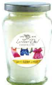
#04495 Classic jar (10oz) $10.00