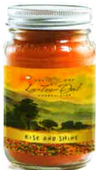
#06029 Mason jar (16oz) $15.00