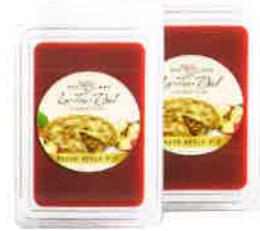
#02348 2 Pack Wax Melts (2.5oz) $10.00