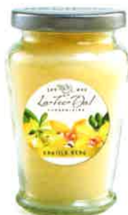
#04499 Classic jar (10oz) $10.00