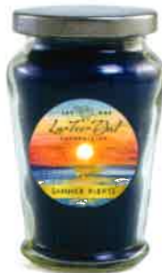
#04497 Classic jar (10oz) $10.00