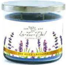
#06611 3-wick jar (14oz) $20.00