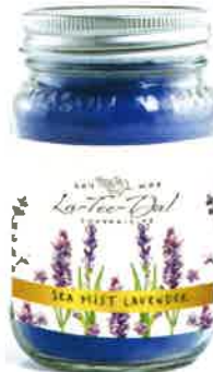
#06030 Mason jar (16oz) $15.00