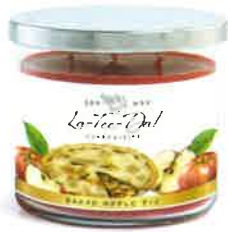
#06600 3-wick jar (14oz) $20.00