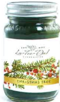
#06023 Mason jar (16oz) $15.00