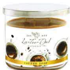
#06606 3-wick jar (14oz) $20.00