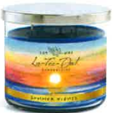
#06613 3-wick jar (14oz) $20.00