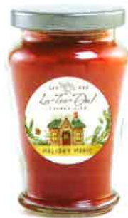
#04436 Classic jar (10oz) $10.00