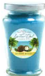
#04496 Classic jar (10oz) $10.00