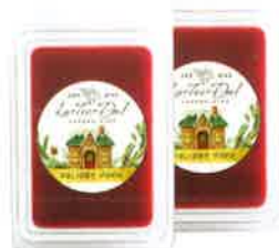
#02352 2 Pack Wax Melts (2.5oz) $10.00

Make your holidays festive with this warm holiday fragrance of sweet McIntosh apple slices, spicy cinnamon, nutmeg and sweet sugary maple.