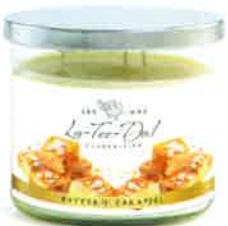
#06602 3-wick jar (14oz) $20.00

A decadent, creamy aroma of fresh baked gooey butter cake with caramelized sugar and sweet vanilla. Yum!