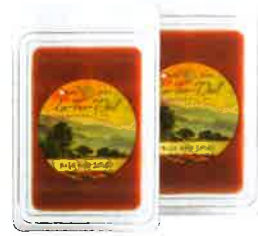
#02343 2 Pack Wax Melts (2.5oz) $10.00

Wake up and hit the floor running with this clean and brisk fragrance that combines fresh, crisp eucalyptus with a sprig of cool spearmint and white cyclamen.