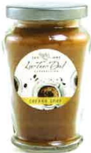
#04493 Classic jar (10oz) $10.00