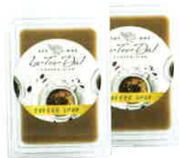
#02340 2 Pack Wax Melts (2.5oz) $10.00

A delectable blend of freshly brewed espresso with whispers of rich caramel and brown sugar swirled with creamy warm vanilla.