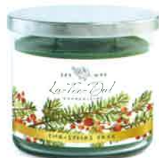
#06603 3-wick jar (14oz) $20.00

The rich frothy scent of creamed butter and brown sugar combined with salted caramel for the ultimate indulgence.