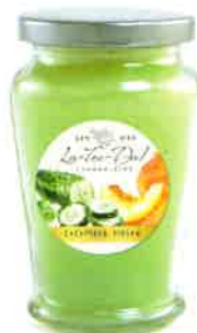
#04406 Classic jar (10oz) $10.00