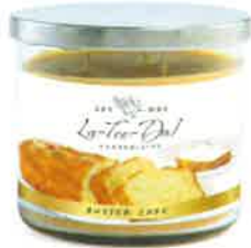
#06601 3-wick jar (14oz) $20.00

One of America's favorite traditions. Juicy red apples baked with swirls of cinnamon, sugar and sweet vanilla.