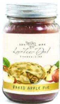
#06004 Mason jar (16oz) $15.00