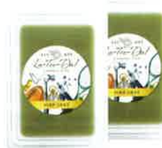
#02341 2 Pack Wax Melts (2.5oz) $10.00

An exhilarating and masculine scent. A fusion of all things manly with a woody base layered with herbs, patchouli and citrus.