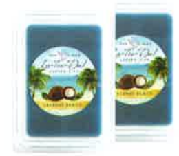
#02350 2 Pack Wax Melts (2.5oz) $10.00