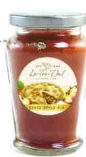
#04400 Classic jar (10oz) $10.00