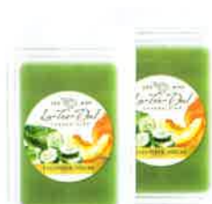
#02351 2 Pack Wax Melts (2.5oz) $10.00

A blend of fresh cut garden cucumbers and fresh honeydew melons that is sure to leave you feeling cool and refreshed.