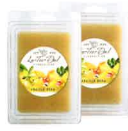
#02347 Wax Melts (2.5oz) $10.00

Sweet tooth lovers, this one's for you! A fluffy vanilla buttercream delicacy that is sure to hit the spot.