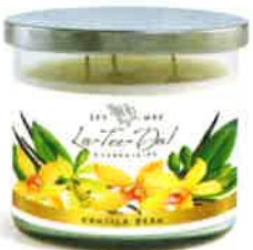
#06614 3-wick jar (14oz) $20.00