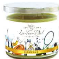
#06608 3-wick jar (14oz) $20.00