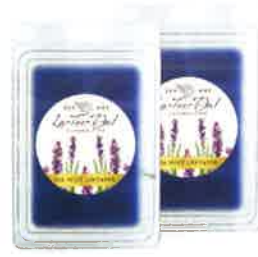
#02344 2 Pack Wax Melts (2.5oz) $10.00

Fresh lavender blends with white roses and water lilies in this beautiful and feminine interpretation of this classic floral fragrance.