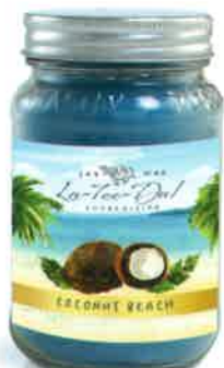
#06020 Mason jar (16oz) $15.00