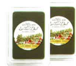
#02349 2 Pack Wax Melts (2.5oz) $10.00