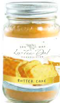
#06021 Mason jar (16oz) $15.00