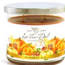
#06609 3-wick jar (14oz) $20.00