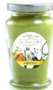
#04488 Classic jar (10oz) $10.00