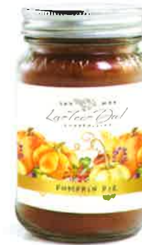
#06028 Mason jar (16oz) $15.00