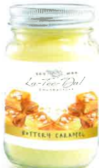
#06022 Mason jar (16oz) $15.00