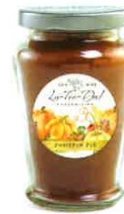
#04489 Classic jar (10oz) $10.00