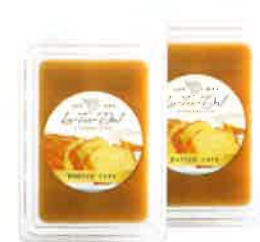
#02338 2 Pack Wax Melts (2.5oz) $10.00