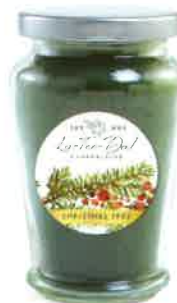
#04464 Classic jar (10oz) $10.00