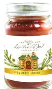
#06026 Mason jar (16oz) $15.00