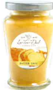
#04491 Classic jar (10oz) $10.00