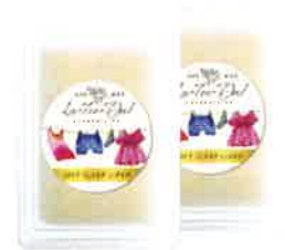
#02345 2 Pack Wax Melts (2.5oz) $10.00

Reminiscent of days gone by. Fresh cotton linens hung on the line. Blowing lazily in a floral scented breeze while being gently sun-dried.