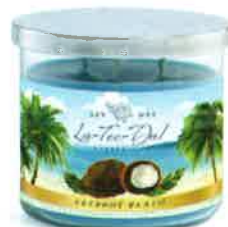
#06604 3-wick jar (14oz) $20.00

Bring back favorite memories of Christmas past and trimming the tree. Fresh balsam fir along with cedar, pinecones and rich bergamot.