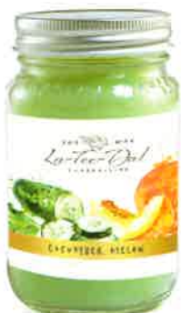
#06024 Mason jar (16oz) $15.00