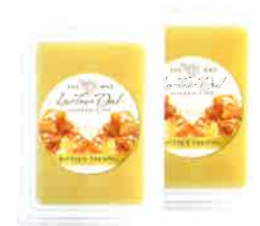
#02339 2 Pack Wax Melts (2.5oz) $10.00