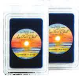
#02346 2 Pack Wax Melts (2.5oz) $10.00

A sophisticated bouquet of patchouli enhanced with vetiver, spicy peppercorn and soft sandalwood. Perfect for a dreamy night.