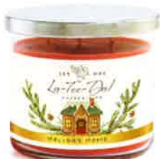
#06607 3-wick jar (14oz) $20.00